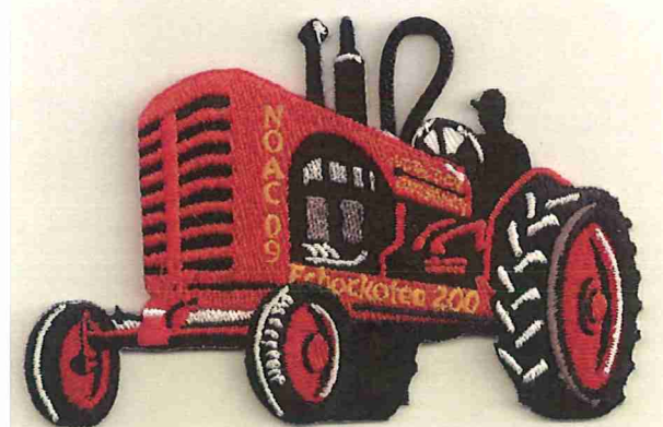
200-X-23 2009 NOAC; given to those members that have paid the deposit fee; 200 made.