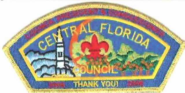
Central Florida Council SA-?? 2008; Council President "Thank You".

Section S-4 neckerchief; first available at the 2008 Section Seminars.