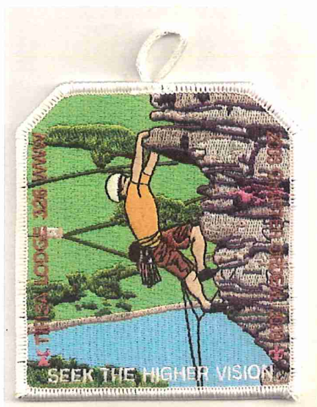
326 2008-2009 Chapter Ordeals. Part of 2008-09 series "Adventures Of Scouting".