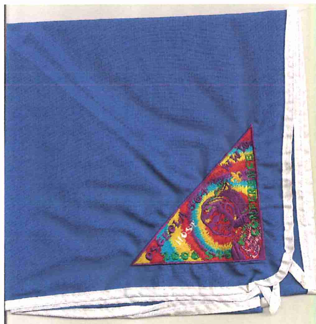
564-N-12 2008; Section S-4S Conference Host.