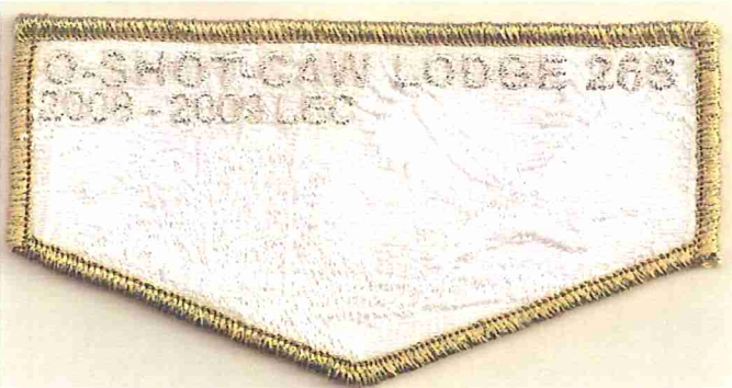
265-S-126 2008; Lodge Executive Committee; 2/ person.