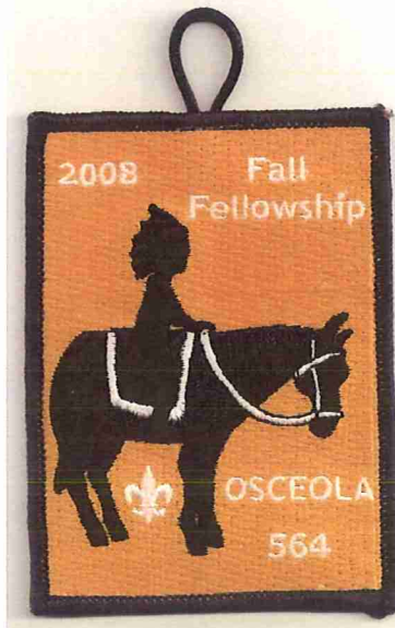
564 2008 Fall Fellowship. Part of 2008 series of "iPod" style designs.