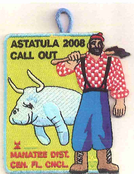
326 Astatula Chapter 2008 Manatee District Call Out. (left) "Paul Bunyan", attendee. (right) "Sasquatch"; staff.