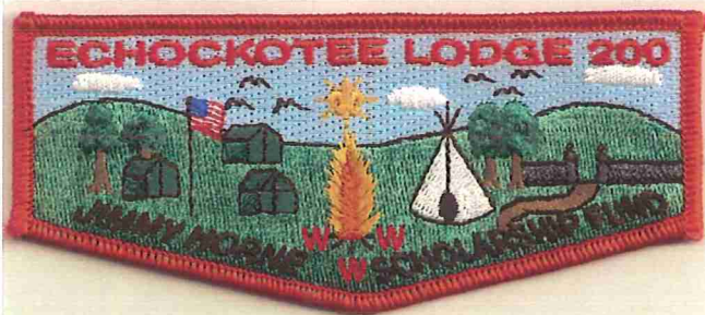
200-S-37 2009; Jimmy Horne Scholarship Fund; RED bdr; sold at $10 each; 100 made.