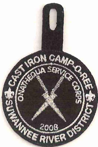
200 Onathequa Chapter 2008 Suwannee River District Camporee Service Corps; 50 made.