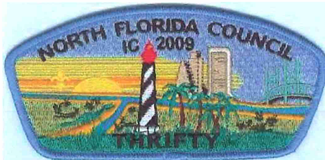
North Florida Council SA-?? 2009 FO$; "Thrifty"; full color.