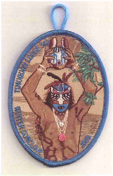
340 2009 Winter Conclave. Part of 2008-09 series "Pre-Columbian Florida Natives".