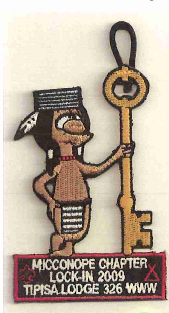
326 Micconope Chapter 2009 Lock-In; 200 made.