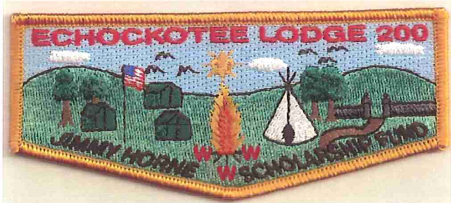
200-S-35 2009; Jimmy Horne Scholarship Fund; GLD bdr; sold at $10 each; 100 made.