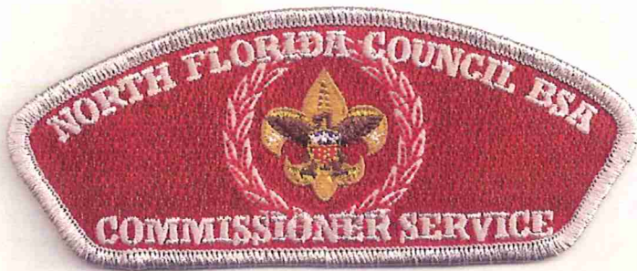
North Florida Council SA-?? 2008; Commissioner Service; 150 made.