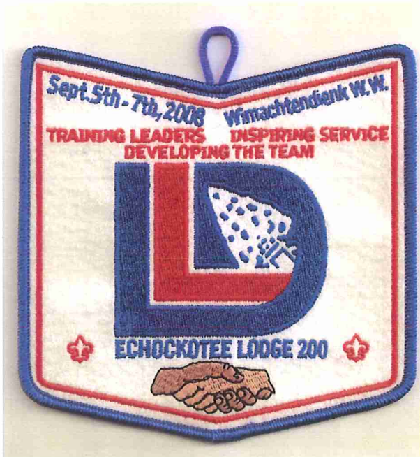
200 2008 Lodge Leadership Development Weekend; 70 made.