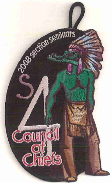
2008 Section S-4 Seminars and Council of Chiefs pocket patch.