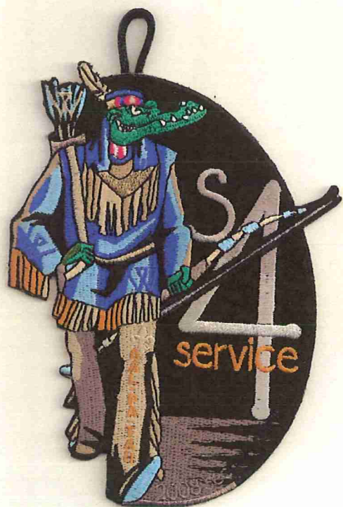
237-X-59 2008 Section S-4 Seminars Host.