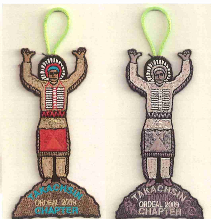
326 Takachsin Chapter 2009 Ordeal. (left) full color; attendee; 150 made. (right) gray embroidery; "THANKS" (given to those giving service for the event); 75 made.