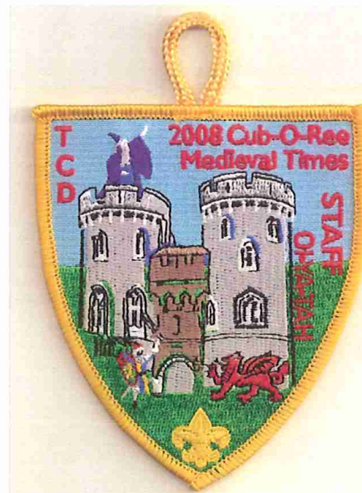
237 Oi-Ya-Tah Chapter 2008 Cub-O-Ree (left) BLU bdr; attendee. (right) GLD bdr; staff.