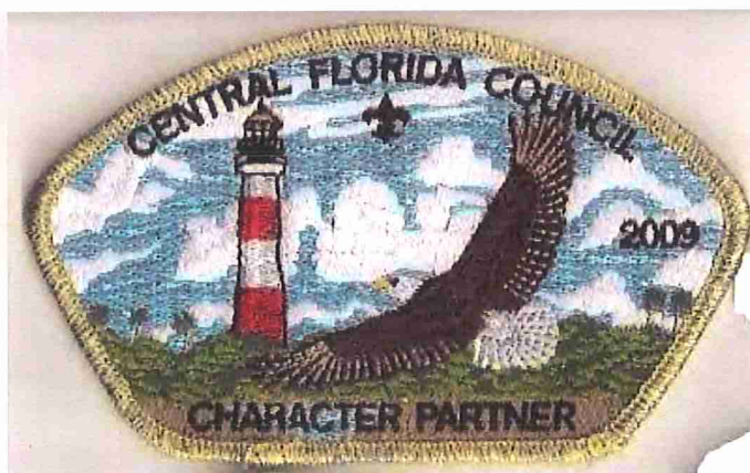
Central Florida Council SA-?? 2009 FO$; GMY border; "Character Partner"