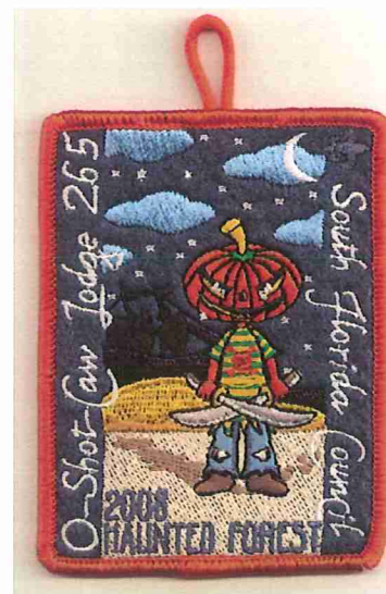
(above) 265 2008 Haunted Forest; attendee. (left) 2008 Haunted Forest; Staff.