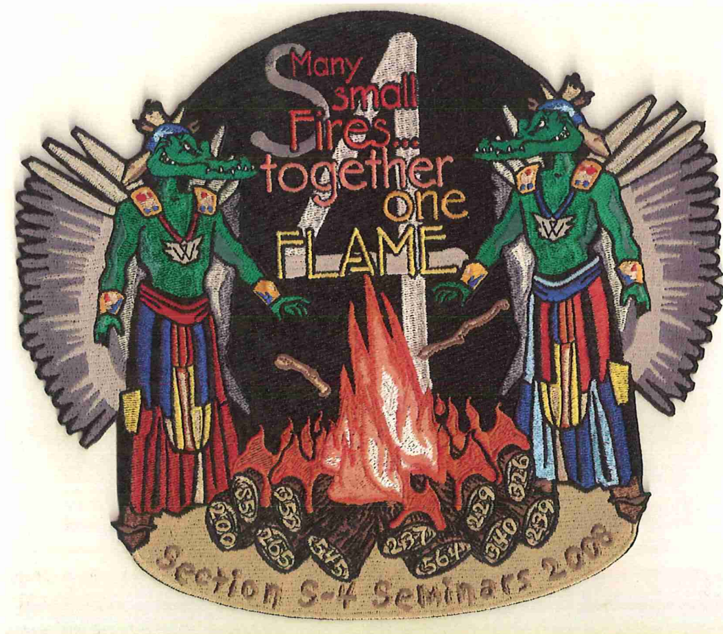
2008 Section S-4 Seminars and Council of Chiefs jacket patch. Sold by the Section as a fundraiser for the Section's 2010 "Four Corps" service project.