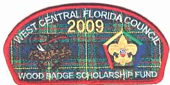
West Central Florida Council SA-?? 2009; Wood Badge Scholarship.