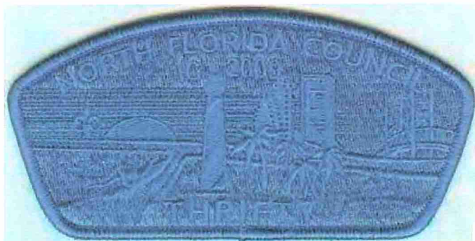
North Florida Council SA-?? 2009 FO$; BLU monochrome; IC presenter.