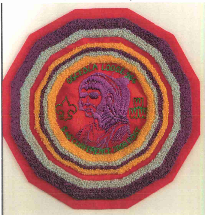
564-C-3 2008; Section S-4S Conference Host.