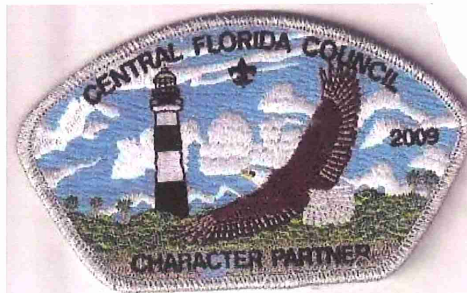
Central Florida Council SA-?? 2009 FO$; SMY border; "Character Partner"