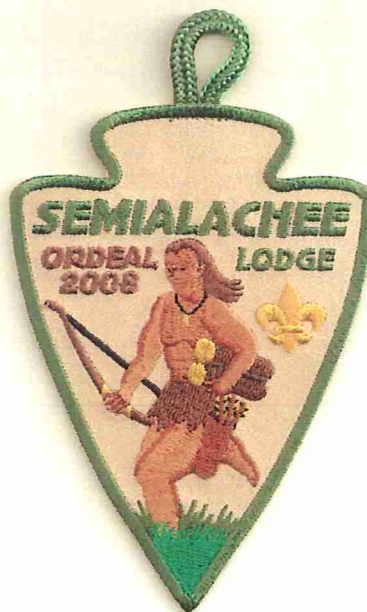
(239) 2008 Ordeal.