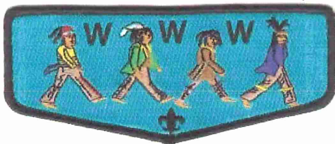
564-S-44 2008; 40th anniversary