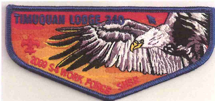
340-S-55 2009; Section S-4 Work Force; available for those that provided 6 hours of service, or sold at $10 each; 300 made.