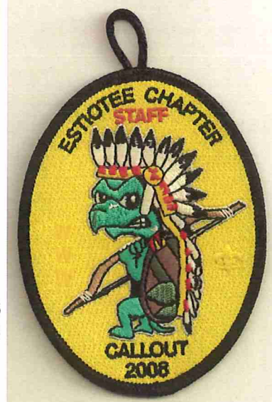
(right, above) 326 Estiotee Chapter 2008 Callout; RED background; attendee. (right) YEL background; STAFF.