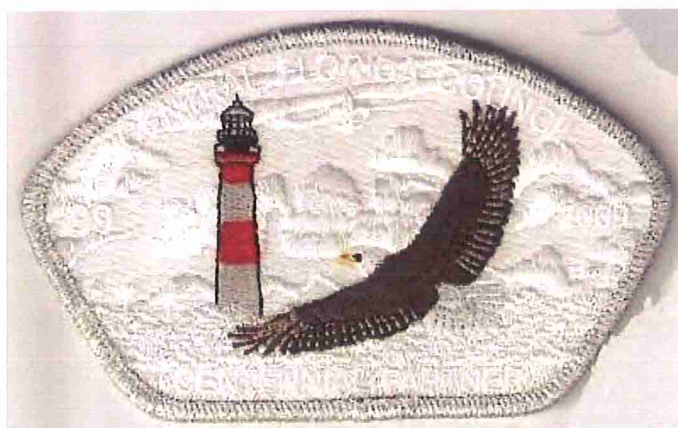
Central Florida Council SA-?? 2009 FO$; "Centennial Partner".