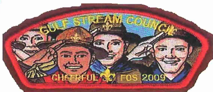
(right) Gulf Stream Council SA-?? 2009 FO$; "Cheerful".