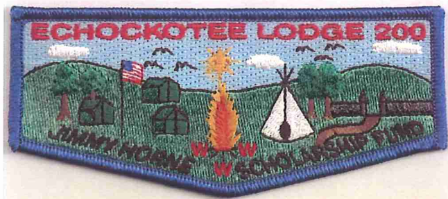
200-S-34 2009; Jimmy Horne Scholarship Fund; BLU bdr; sold at $10 each; 100 made.