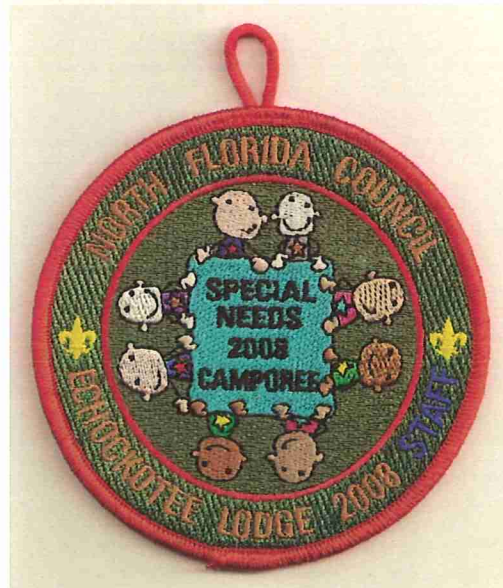
200 2008 Special Needs Camporee Staff.