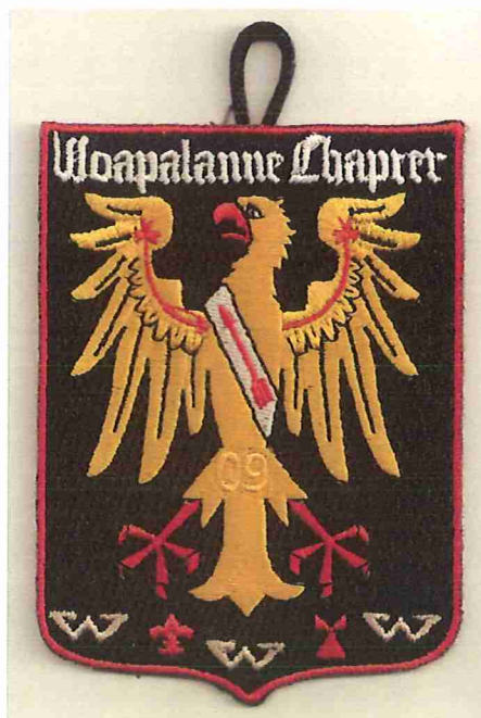
326 Woapalanne Chapter X-4 2009