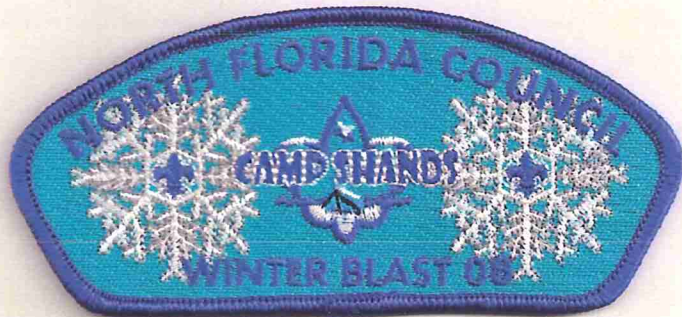
North Florida Council SA-?? 2008; Winter Blast (resident camp); BLU bdr; attendee.