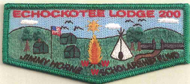
200-S-36 2009; Jimmy Horne Scholarship Fund; GRN bdr; sold at $10 each; 100 made.