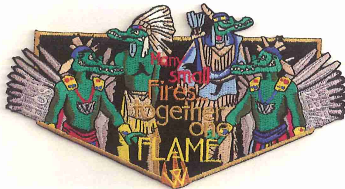
237-S-94 2008; Section S-4 Seminars & Council of Chiefs.