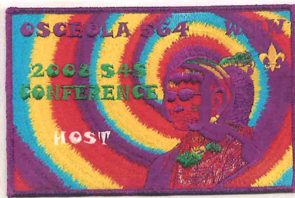
564-J-3 2008; Section S-4S Conference Host.