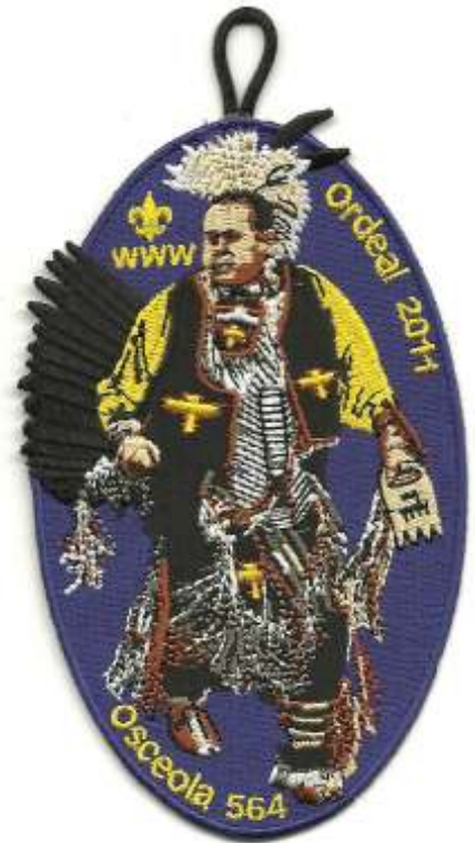
564 (above) 2011 Ordeal. (below) 2011 Ordeal, Elangomat. Parts of 2011 series, depicting native American dancers.