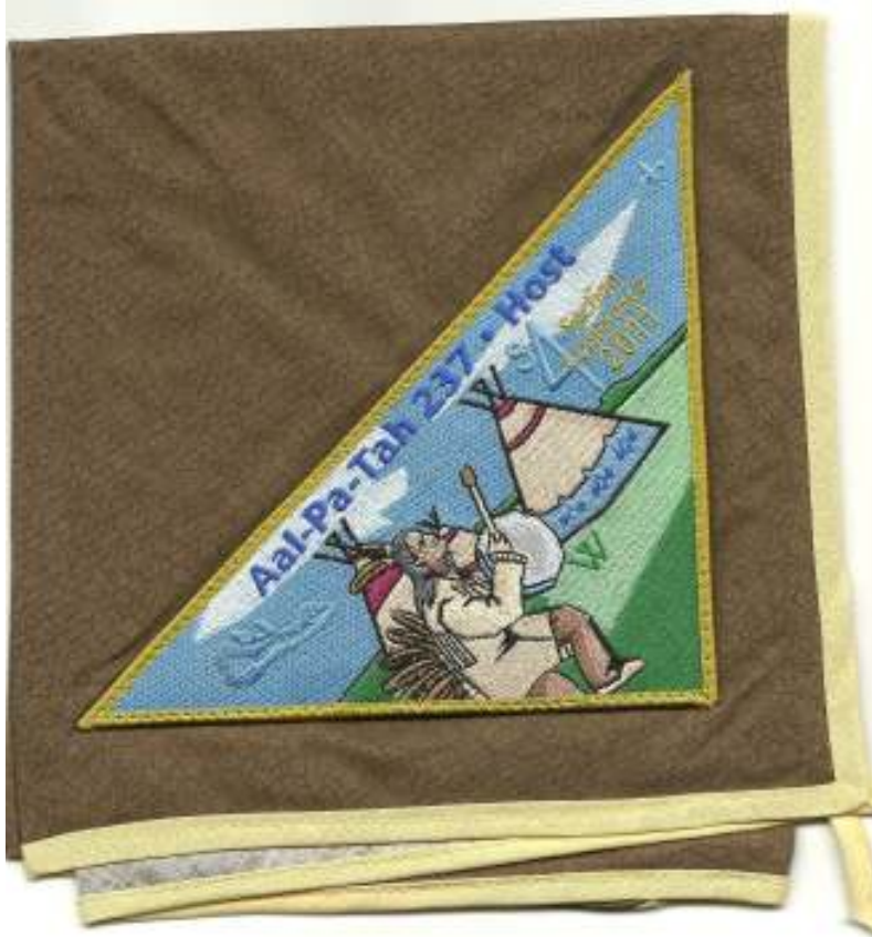
237-N-34 2011; Section S-4 Conference Host; GLD border. Unrestricted to lodge members.