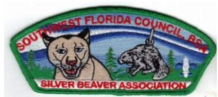
Southwest Florida Council CSP SA-?? 2011; Silver Beaver Association; GRN border, BLU/WHT/BLU fdl.