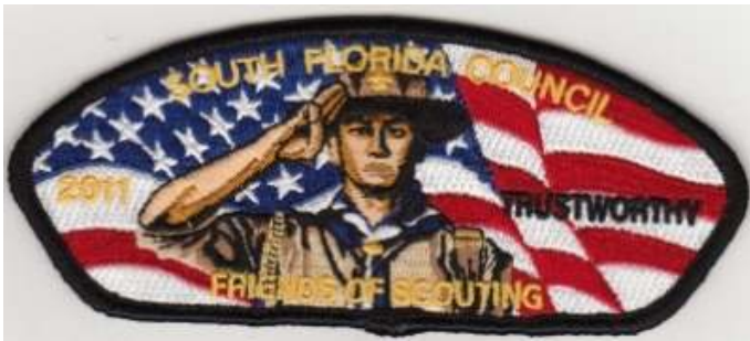
South Florida Council CSP SA-?? 2011; FO$; BLK border.