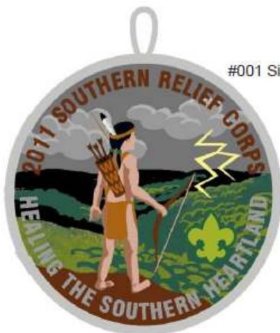
#001 Silver Patch