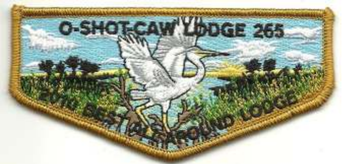
265-S-136 2011; Best All Around Lodge; available to all lodge members.