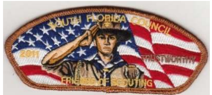
South Florida Council CSP SA-?? 2011; FO$; CPR border.