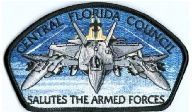
Central Florida Council CSP S-?? 2011; "SALUTES THE ARMED FORCES" set; Air Force