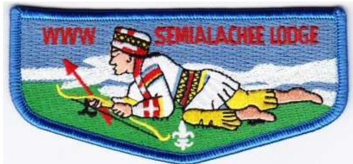
239-S-80?? 2010; "Lodge Advisor's Choice Award"; BLU border, no lodge number.