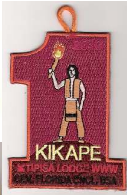
(left) 326 Spring Conclave. Part of 2010-11 series, "60th Anniversary Of Camp La-No-Che". (above) 326 Kikape Chapter X-1.