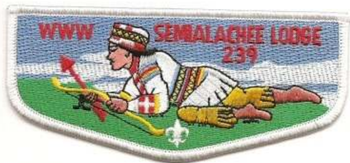
239-S-79?? 2010; regular issue; smaller numbers; manufactured by "Authentic Custom Patch"? (found on OAIMages.com)