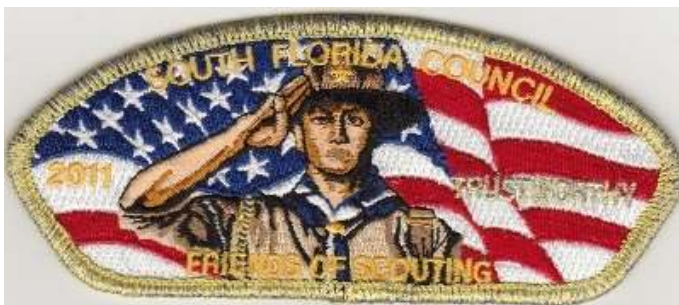
South Florida Council CSP SA-?? 2011; FO$; GMY border.