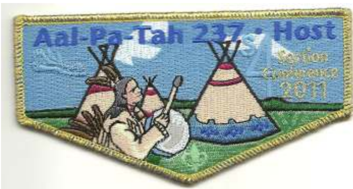
237-S-108 2011; Section S-4 Conference Host; GMY border.