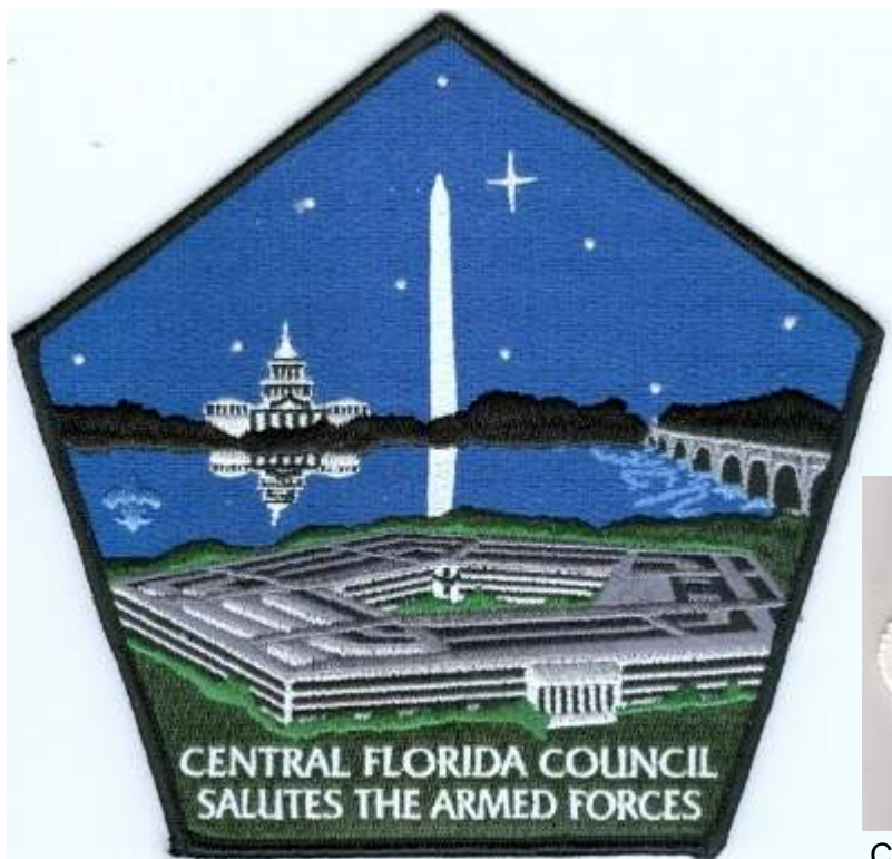
Central Florida Council jacket patch 2011; "SALUTES THE ARMED FORCES"