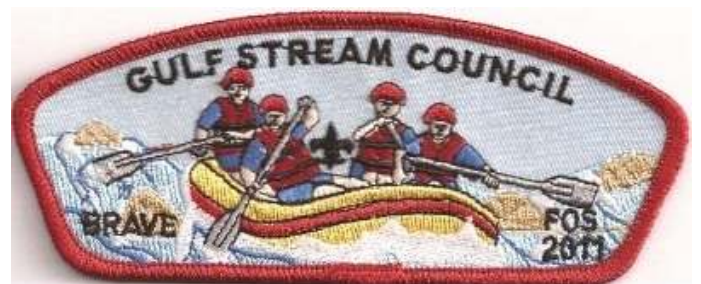
Gulf Stream Council SA-?? 2011 FO$.