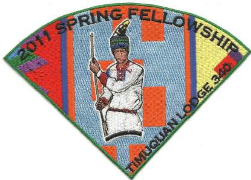
340 2011 activity patches. (top—bottom) 2011 Spring Fellowship, 2011 Lodge Banquet, 2011 S-4 Conference.