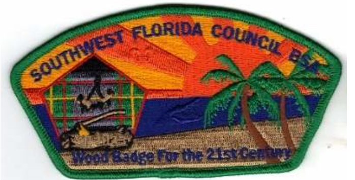
Southwest Florida Council CSP SA-?? 2011; Wood Badge.