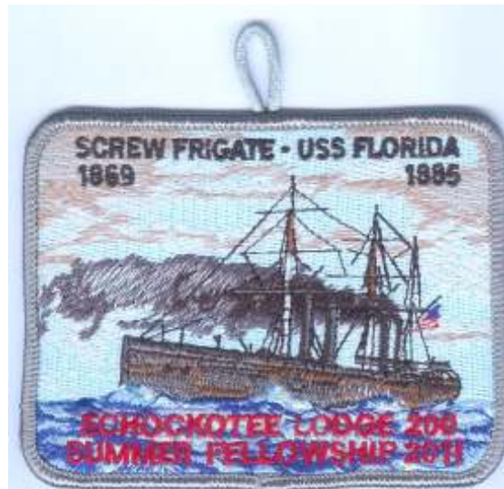
200 2011 Summer Fellowship. Part of 2011 activity patch series, "Ships Named Florida". 300 made.