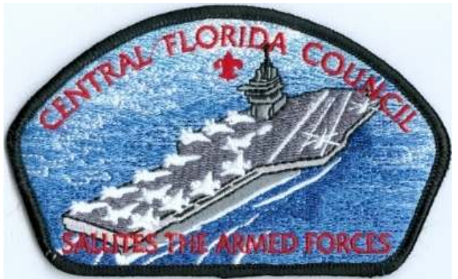
Central Florida Council CSP S-?? 2011; "SALUTES THE ARMED FORCES" set; Navy