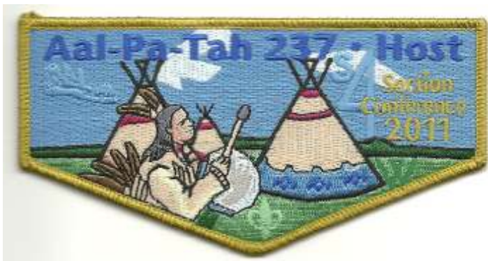
237-S-107 2011; Section S-4 Conference Host; GLD border.