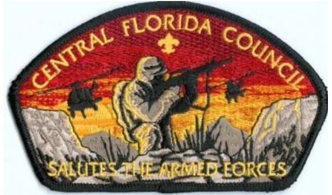
Central Florida Council CSP S-?? 2011; "SALUTES THE ARMED FORCES" set; Marines