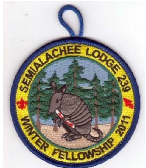
(above) 239 2010-2011 activity patches. (left—right) 2010 Ordeal, 2010 Fall Fellowship, 2011 Winter Fellowship. Parts of 2010-2011 series “Celebrating The Nature of Wallwood”. (below) 2011 Wiregrass Fellowship (joint activity with Alapaha Lodge 545).