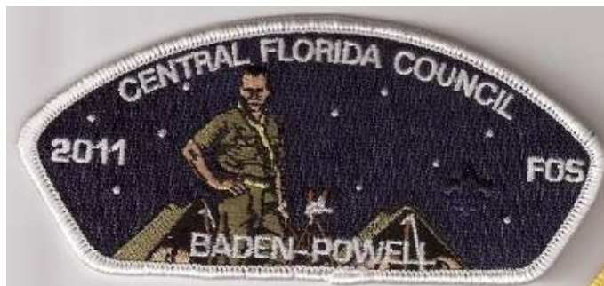
Central Florida Council SAP S-?? 2011; FO$; "Baden-Powell".