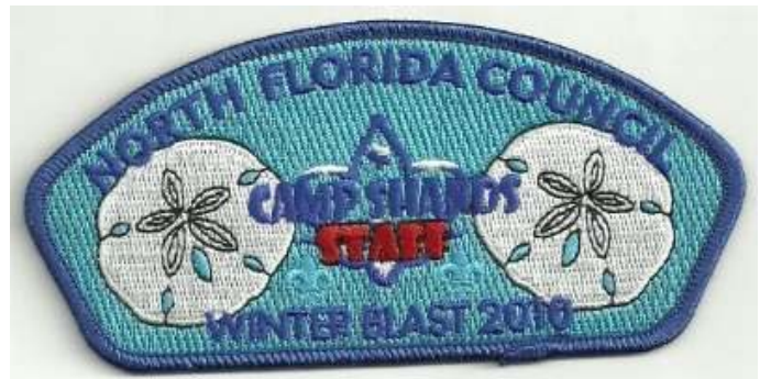
North Florida Council CSP SA-?? 2011; 2010 Winter Blast, STAFF (error from previous issue corrected)