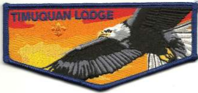
340-S-60 2011; regular issue.