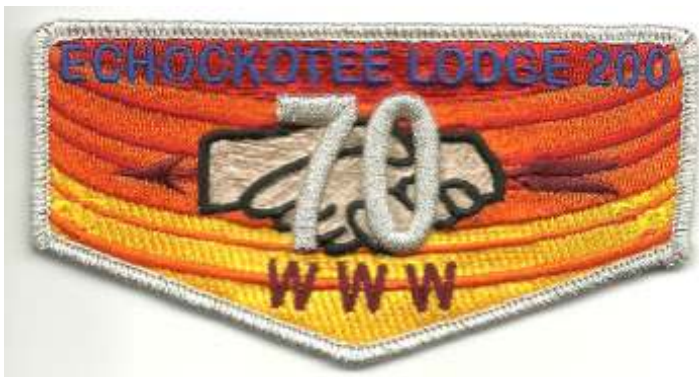
200-S-44 2011; 70th anniversary; 800 made.