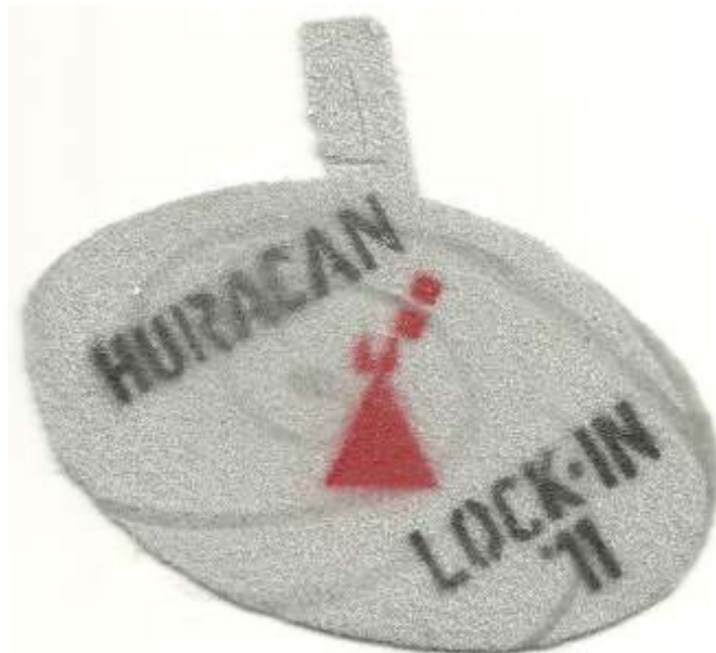
326 Huracan Chapter 2011 Lock-In. Handprinted, 40 made.