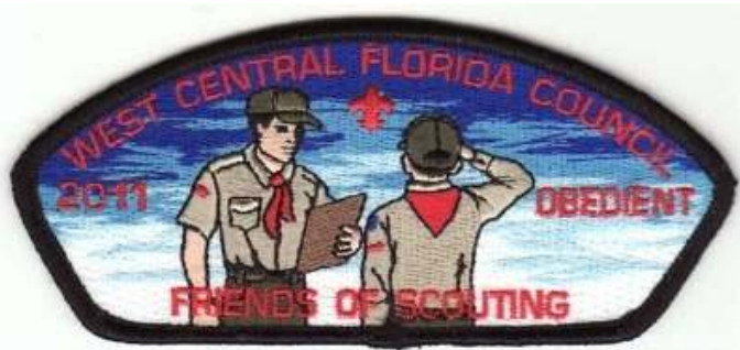
West Central Florida Council CSP SA-?? 2011; FO$; Scout Law ("OBEDIENT"); $196 donation.