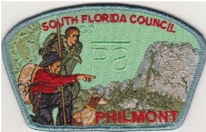
South Florida Council CSP SA-?? 2011; Philmont Trek.