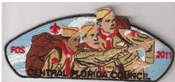
Central Florida Council SAP S-?? 2011; FO$