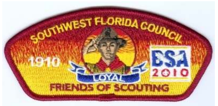
Southwest Florida Council CSP SA-?? 2010; FO$.