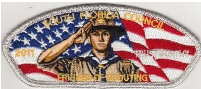
South Florida Council CSP SA-?? 2011; FO$; SMY border.