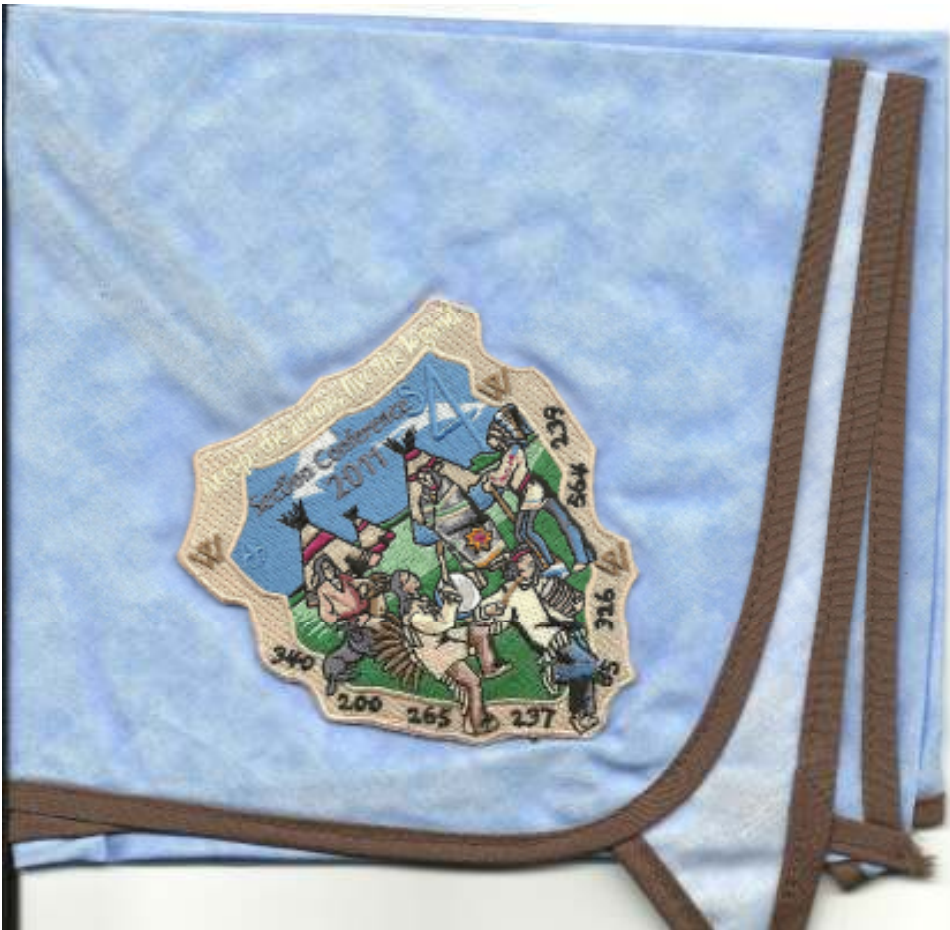
2011 Section S-4 Conference. (above) neckerchief. (below) 2011 S-4 Golf Tournament.