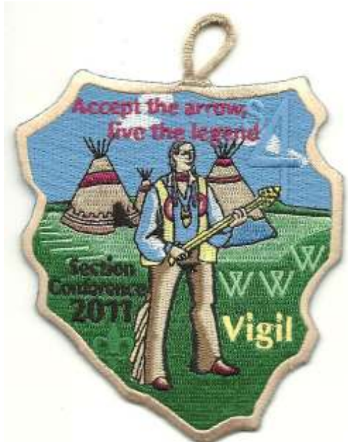
2011 Section S-4 Conference. (left) Vigil Breakfast patch. (right) VIA Luncheon patch. Both were available via pre-order.