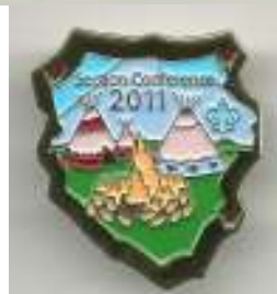
2011 Section S-4 Conference. (above) "special" patch (felt background below the lodge numbers; sold for $10 each). (right, above) belt buckle. (right) hat pin.