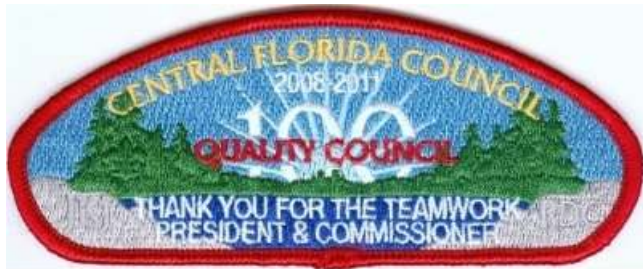
Central Florida Council CSP S-?? 2008-2011 Quality Council.