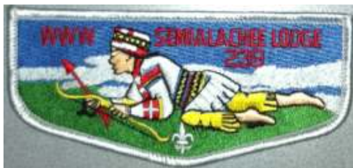
239-S-82?? 2011; new regular issue; block numbers; manufactured by Stadri.