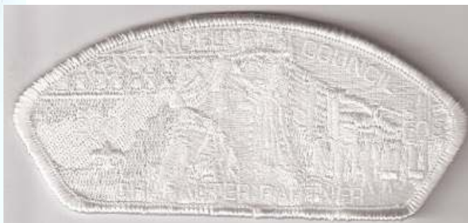
Central Florida Council SAP S-?? 2011; FO$; "CHARACTER PARTNER"; WHT monochrome.