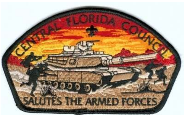
Central Florida Council CSP S-?? 2011; "SALUTES THE ARMED FORCES" set; Army