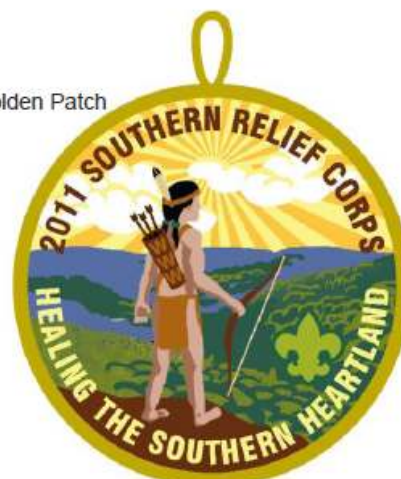
#002 Golden Patch