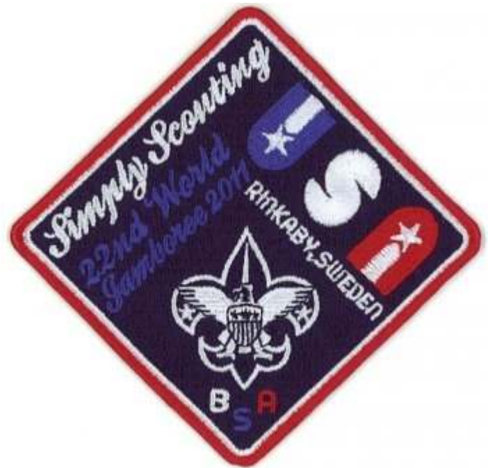
(left) 2011 World Jamboree patch (above) 2011 World Jamboree USA contingent patch. (below) 2011 World Jamboree USA contingent "puzzle" set.