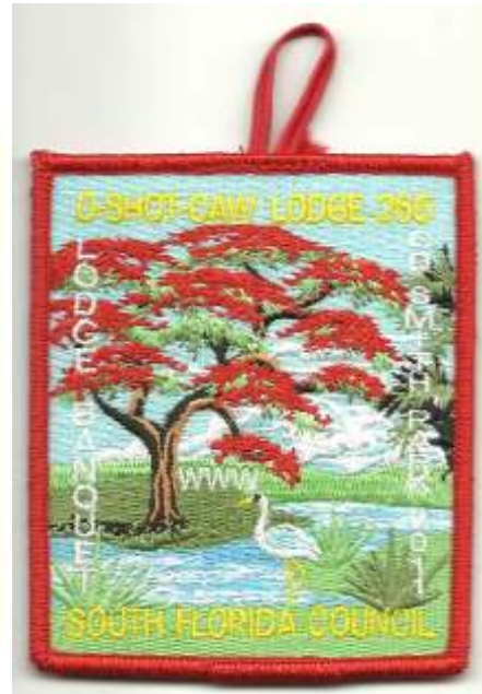
265 (left) 2011 Winter Conclave. (right) 2011 Lodge Banquet. Parts of 2010-11 activity patch series, depicting natural scenes of South Florida.