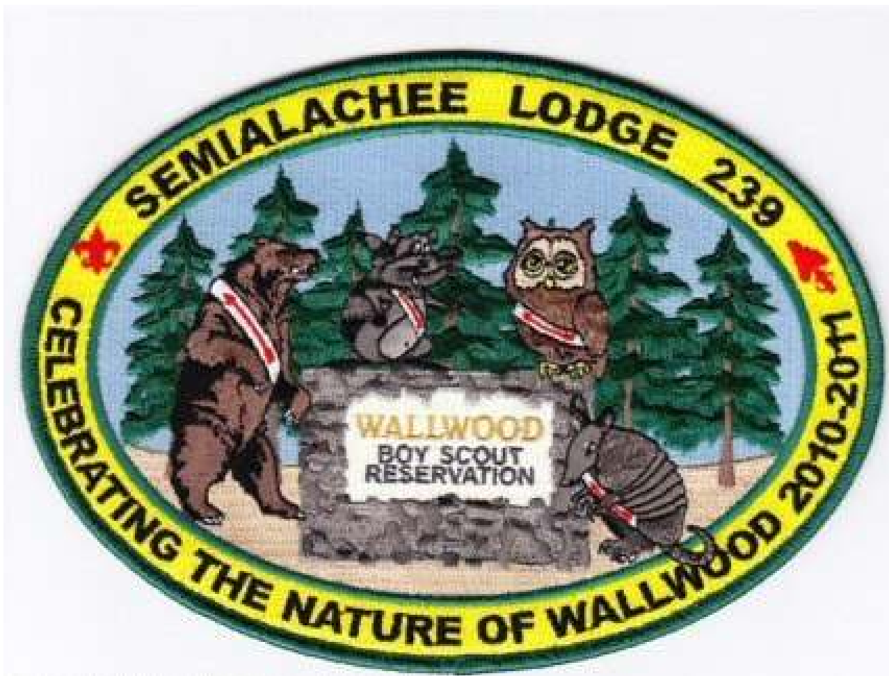
239 2010-2011 year patch. Part of "Celebrating The Nature Of Wallwood" activity patch theme for 2010-2011