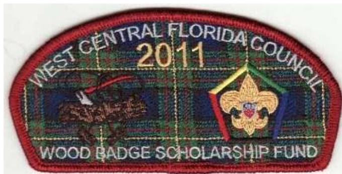
West Central Florida Council SAP S-?? 2011; Wood Badge Scholarship Fund.