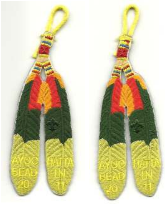
326 Ayochatta Chapter 2011 "Bead-In" activity. (left) "BEADER"; 75 made. (right) no "BEADER"; 125 made.