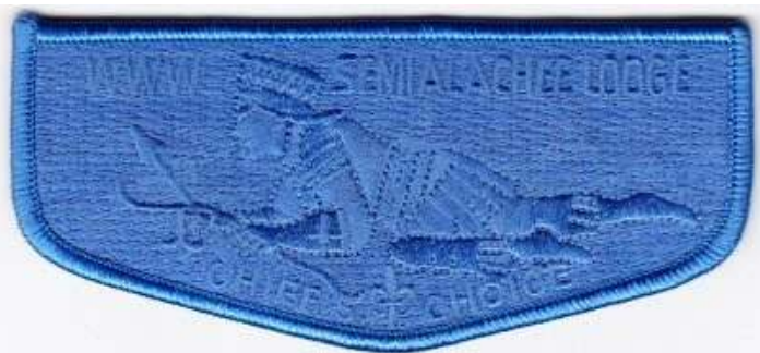
239-S-81?? 2010; "LODGE CHIEF'S CHOICE" award; BLU monochrome.