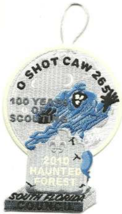
265 (left 2010 Haunted Forest; glow-in-the-dark border; staff.