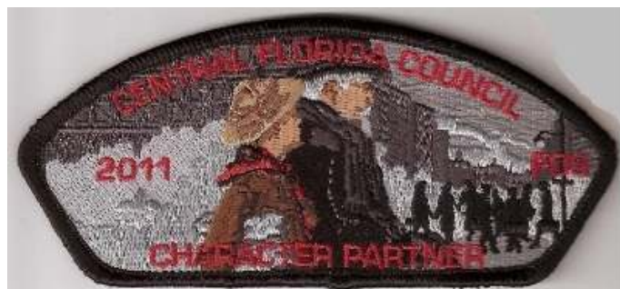
Central Florida Council SAP S-?? 2011; FO$; "CHARACTER PARTNER"; full color.