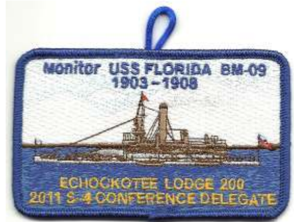
200 2011 Section S-4 Conference Delegate. Part of 2011 activity patch series, "Ships Named Florida". 300 made.