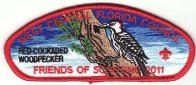
West Central Florida Council CSP SA-?? 2011; FO$; Endangered Species ("RED COCKADED WOODPECKER"); $250 donation.