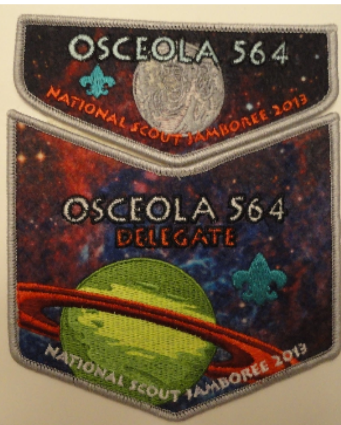
564-F-25 with X-22 2013 National Jamboree; two-piece set; trader (RED letters on flap; Saturn on chevron)