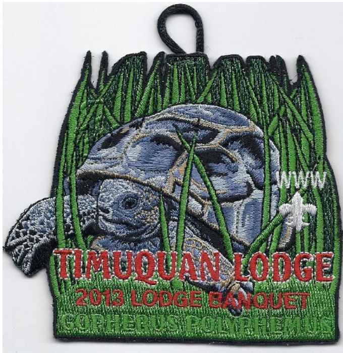
340 (above, left—right) 2013 Winter Conclave, 2013 Vigil Breakfast. (left) 2013 Lodge Banquet. Parts of 2012-2013 series, "Sand Hill Scout Reservation Wildlife". (below) 2013 Summer Conclave.