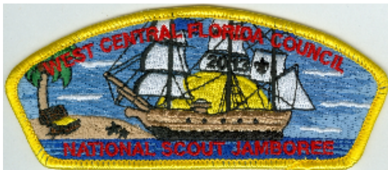
West Central Florida 2013 National Scout Jamboree JSP.