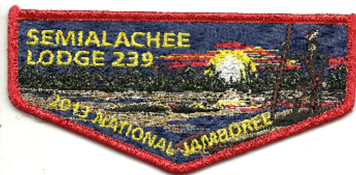
239-S-89 2013; National Jamboree.