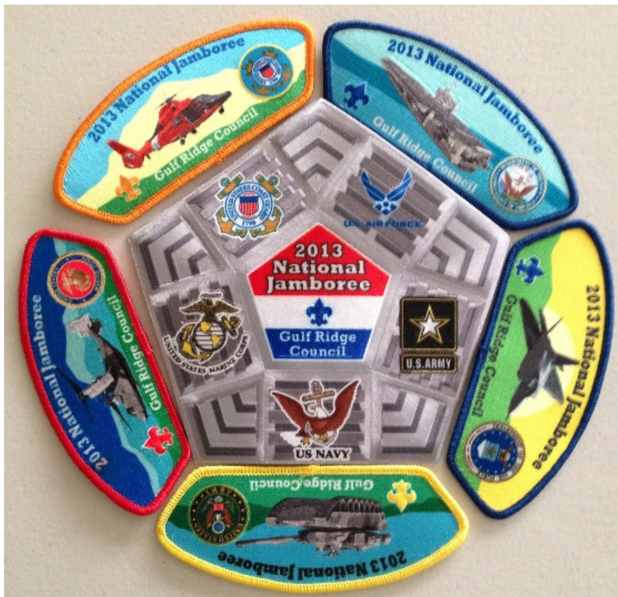
Gulf Ridge Council 2013 National Jamboree set (five JSPs, one back patch).