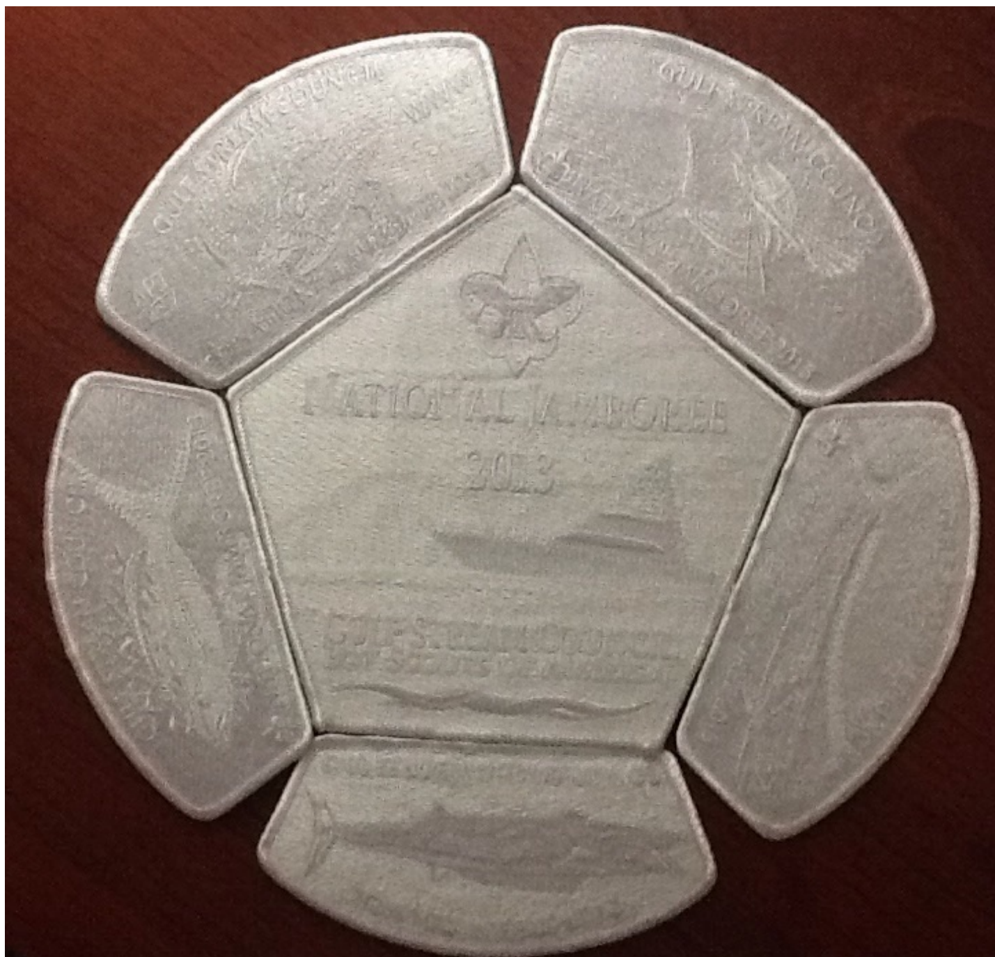
Gulf Stream Council 2013 National Scout Jamboree set; WHT monochrome. Five JSPs, one back patch. Full color set pictured in previous issue.