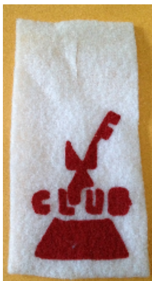
326 Huracan Chapter 2013 LLDC felt handmade patch.