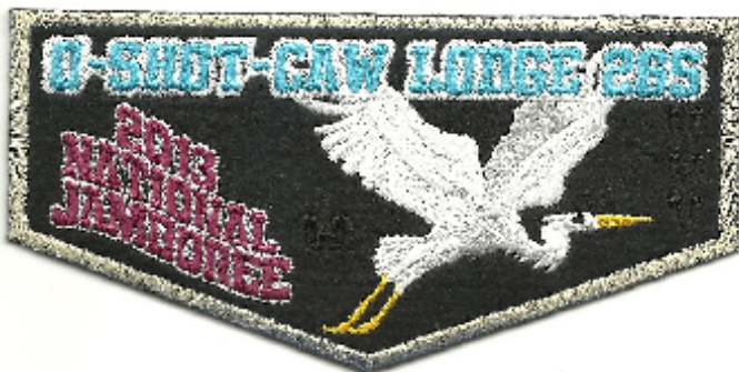
265-F-36 2013; National Jamboree; BLK felt background; GMY border.