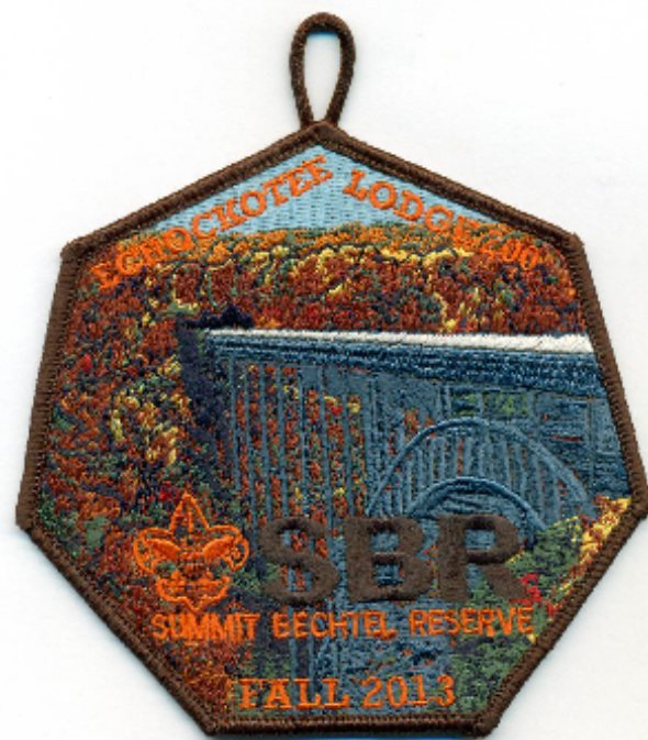
200 2013 Fall Fellowship. Part of 2013 series, "BSA High Adventure Bases".