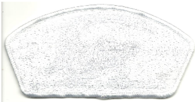
2237-X-79 2013; National Jamboree; JSP; WHT monochrome.