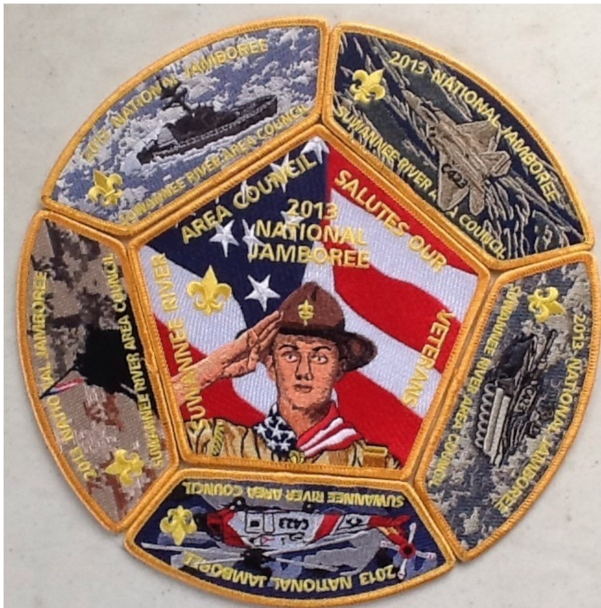
Suwannee River Area Council 2013 National Scout Jamboree (above) set. Five JSPs, one back patch. (right) Jamboree pocket patch. (below) JSP.