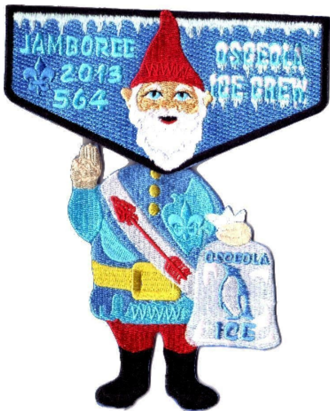
564-S-54 with X-23 2013; National Jamboree; Ice Crew (staff group)