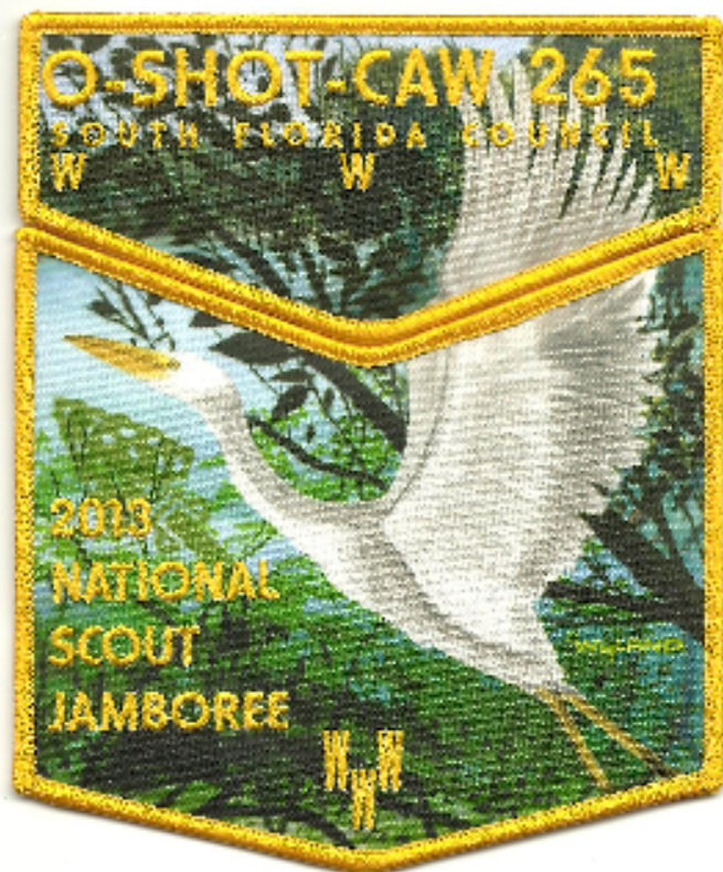
265-F-37 with X-57 2013 National Jamboree; two-piece set