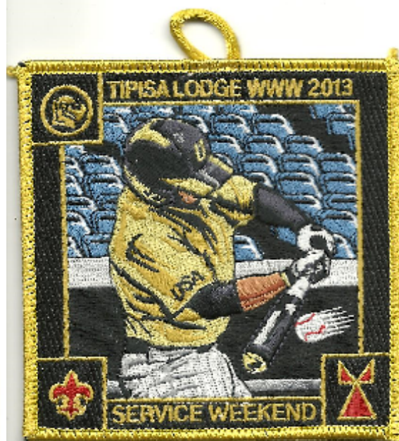
326 2013 Service Weekend. Part of 2012-2013 series "Athletics of an Unnamed University in Orlando"