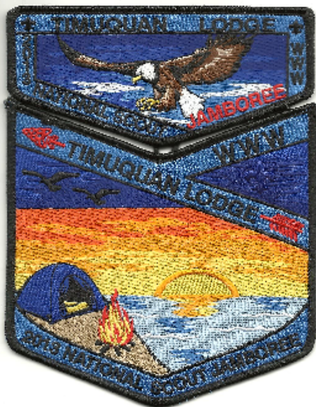
340-S-63 with X-20 2013 National Jamboree; two-piece set