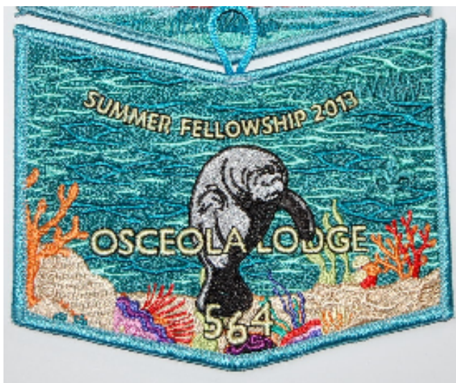
564 2013 Summer Fellowship.