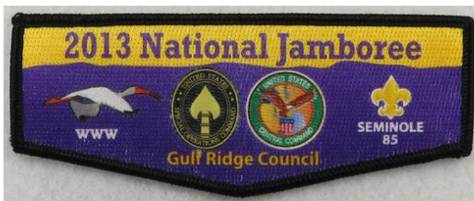
085-F-7 2013; National Jamboree.