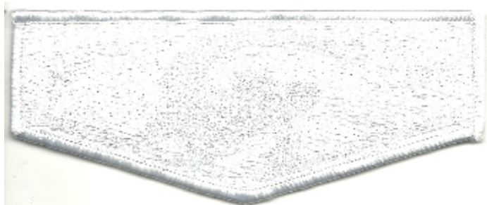
237-S-117 2013; National Jamboree; WHT monochrome.