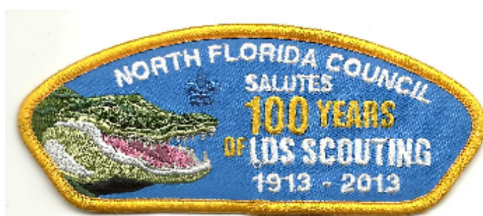
North Florida Council TA-?? 2013; 100th Anniversary of LDS Scouting.