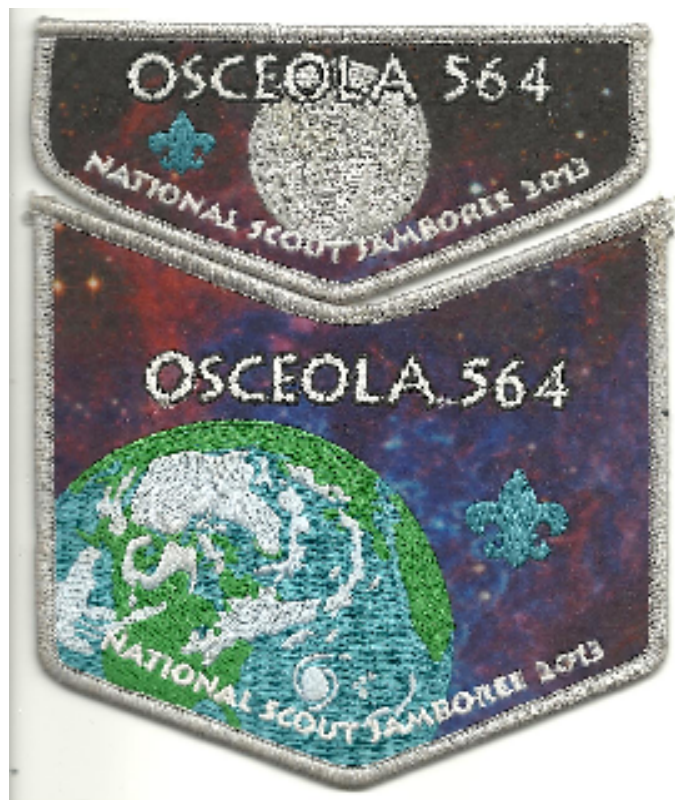
564-F-24 with X-21 2013 National Jamboree; two-piece set; trader (WHT letters on flap; Earth on chevron)