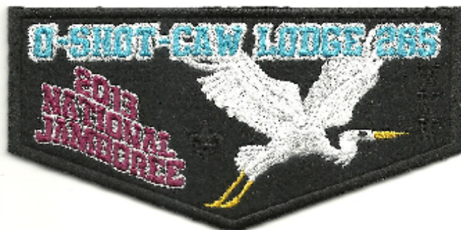
265-F-35 2013; National Jamboree; BLK felt background; BLK border.