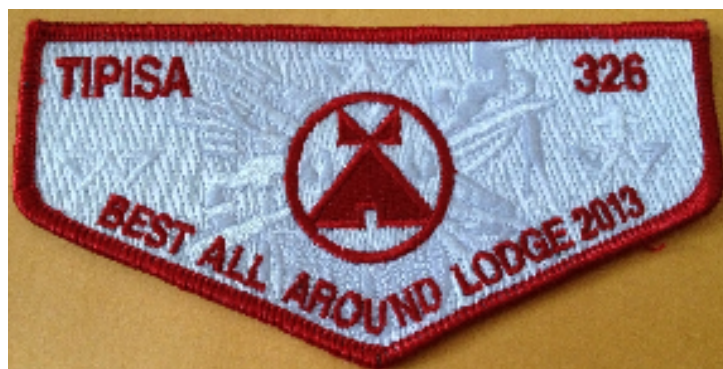
326-S-49 2013; S-4 Best All-Around Lodge.