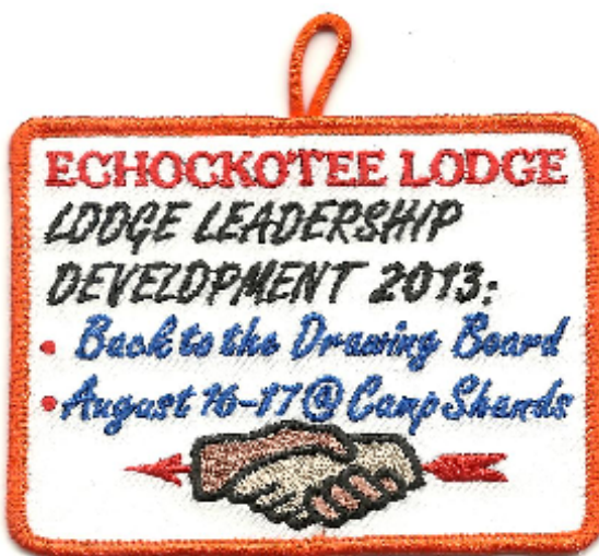
200 2013 LLD 200 made