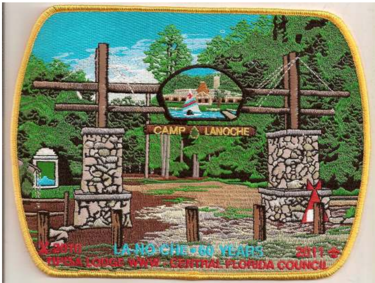
326 2010-2011 year patch. Part of 2010-2011 series, "60 Years of La-No-Che".