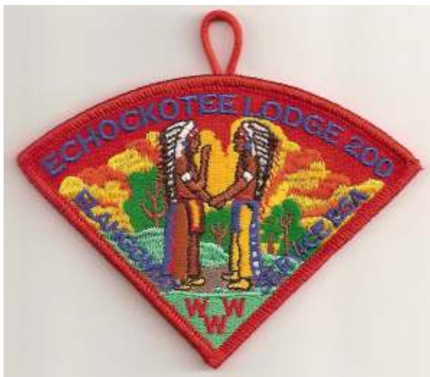
200-P-6 2011; Elangomat Service; BLU BSA; 100 made