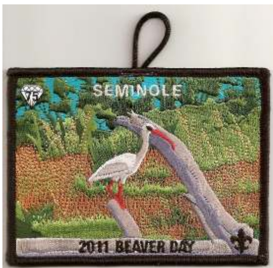
85 2011 Beaver Day. Part of a five piece series.