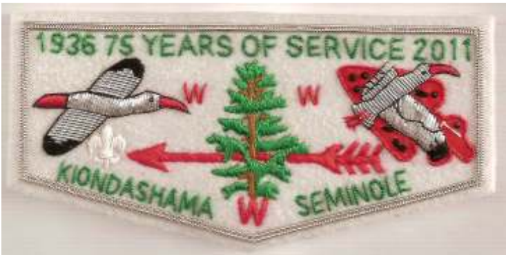
85-B-3 2011; lodge 75th anniversary; 95 made.