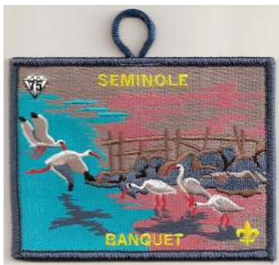
85 2011 Lodge Banquet. Part of a five piece series.