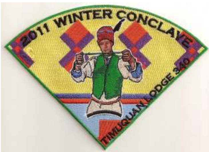
340 2011 Winter Conclave. Part of 2010-2011 puzzle set