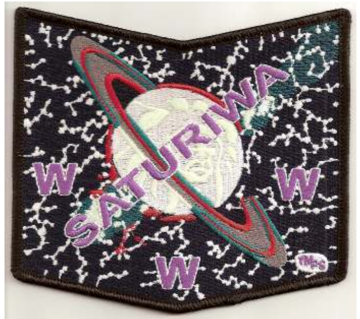
200 Satoriwa Chapter X-1 2011; no lodge name; 50 made.