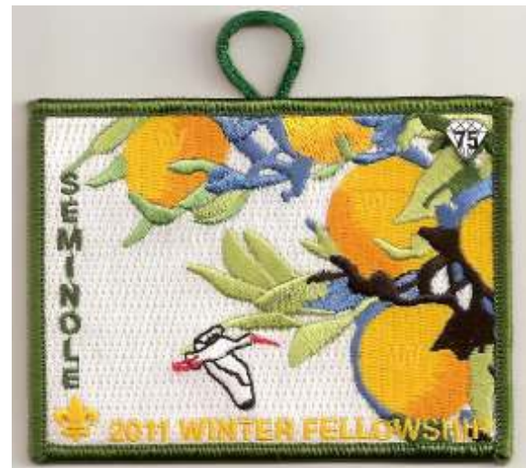
85 2011 Winter Fellowship. Part of a five piece series.