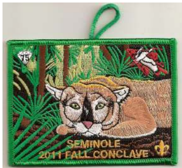
85 Fall Conclave. Part of a five piece series.