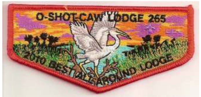
265-S-135 2010; Lodge Executive Committee