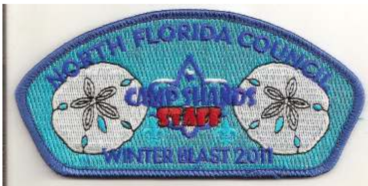
North Florida Council CSP SA-?? 2010 Winter Blast (year error); STAFF.