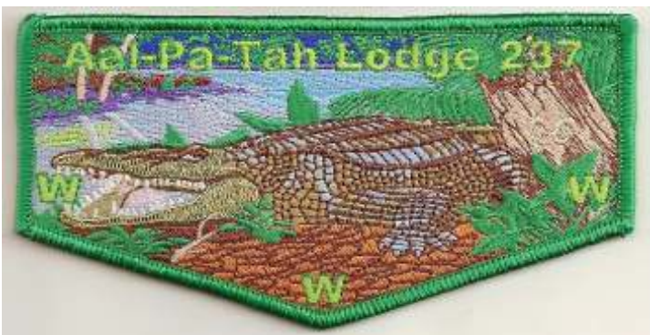
237-S-106 2011; regular issue