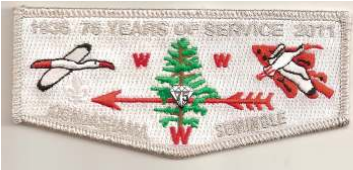
85-S-58 (BB S-57) 2011; lodge 75th anniversary.