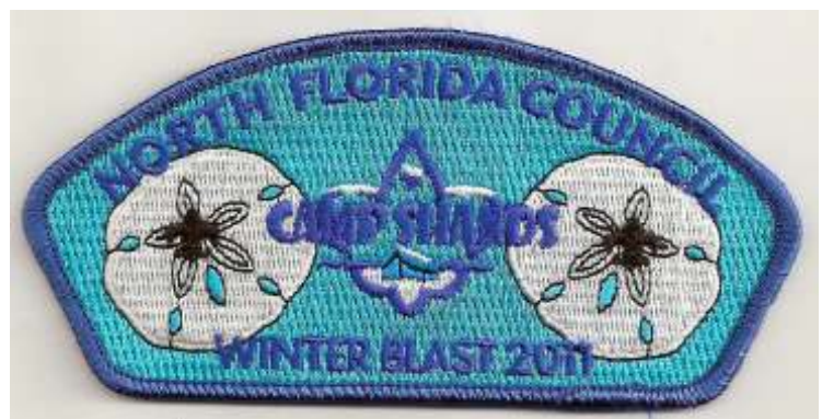
North Florida Council CSP SA-?? 2010 Winter Blast (year error); Scout fdl.