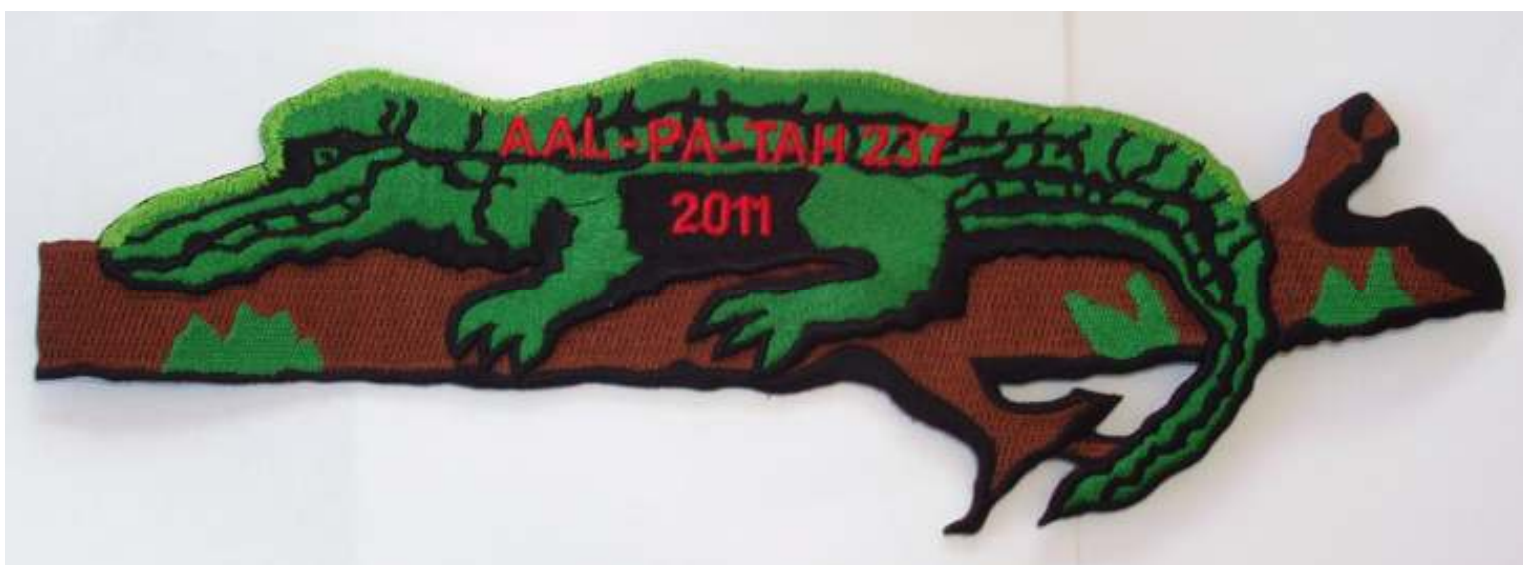
237 2011 year patch. Part of 2011 series, featuring older Aal-Pa-Tah 237 designs.