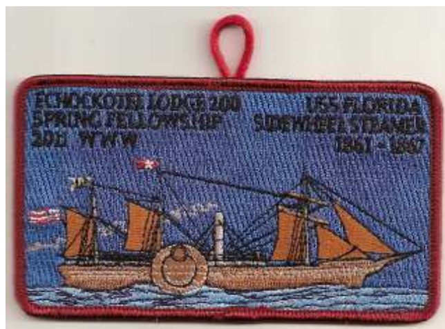
200 2011 Spring Fellowship. Part of 2011 series, "Ships Named Florida".