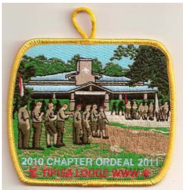
326 2010-2011 Chapter Ordeal. Part of 2010-2011 series, "60 Years of La-No-Che".