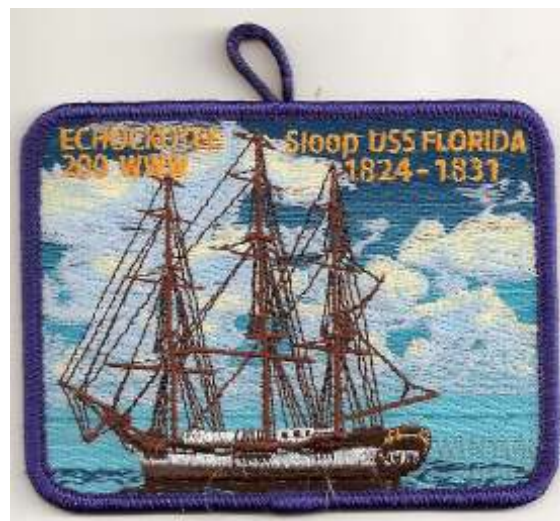
200 2011 Winter Fellowship. Part of 2011 series, "Ships Named Florida".