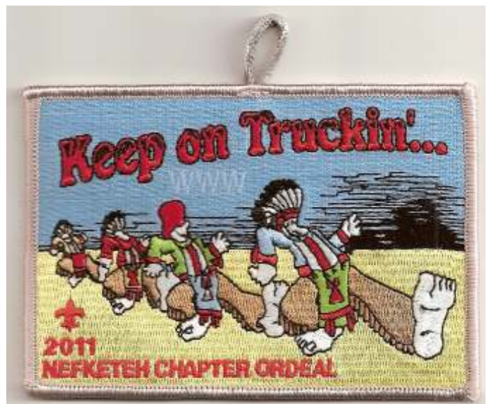
326 Nefkete Chapter (left) 2010 Callout Weekend. (right) Chapter Ordeal.