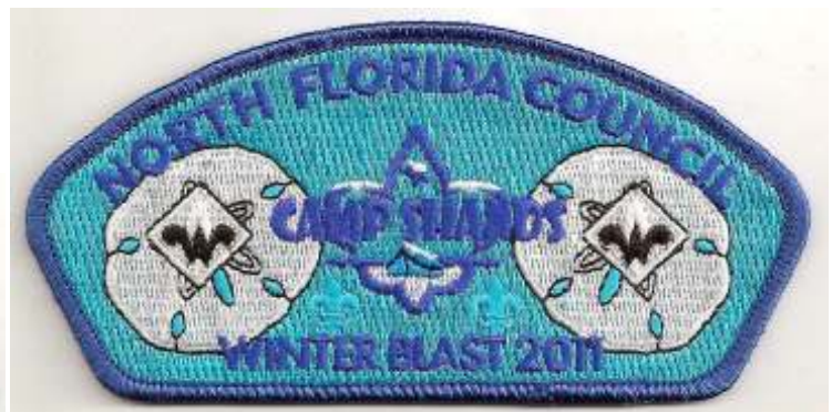
North Florida Council CSP SA-?? 2010 Winter Blast (year error); Webelos fdl.