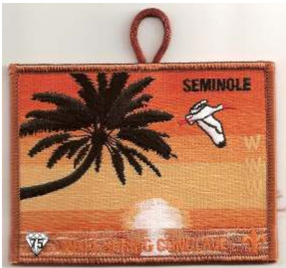
85 2011 Spring Conclave. Part of a five piece series.