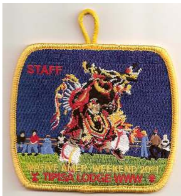
326 (above) 2011 Tipisa Native American Weekend Staff (council event, run by the lodge) Part of 2010-2011 series, "60 Years of La-No-Che". (left) 2011 Tipisa Native American Weekend participant patch; issued 1/ person.