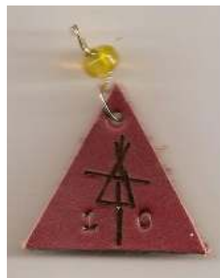
326 2010 Vigil Gathering. Leather triangle with a tipi and "10".