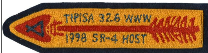
✓ Description Made C4 (1998) ???