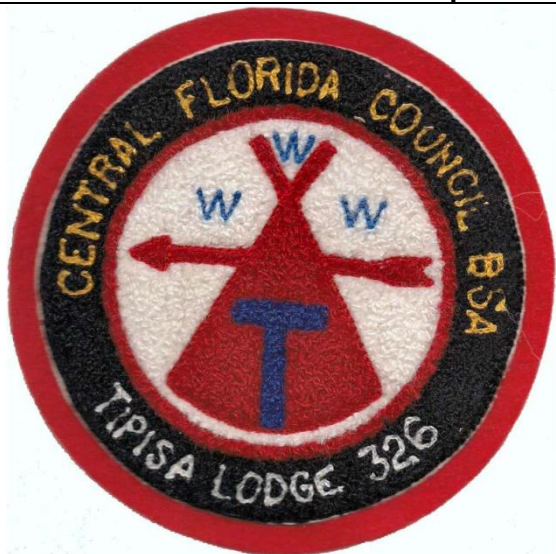
✓ Description Made C1 (5" Diameter - Red Backing) 100?