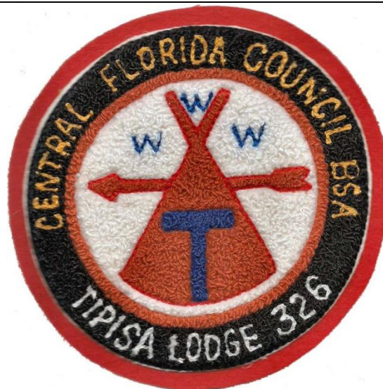
✓ Description Made C2 (5" Diameter - White Backing) 100?