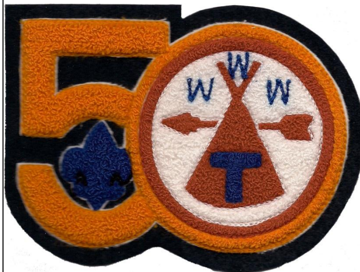
✓ Description Made C3b (1996 Split Arrow) ???