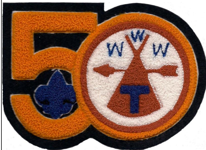
✓ Description Made C3a (1996 Continuous Arrow) ???